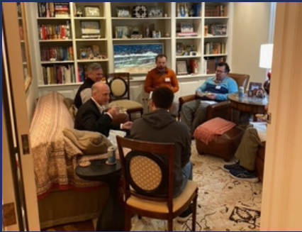
Intergenerational Men's Group