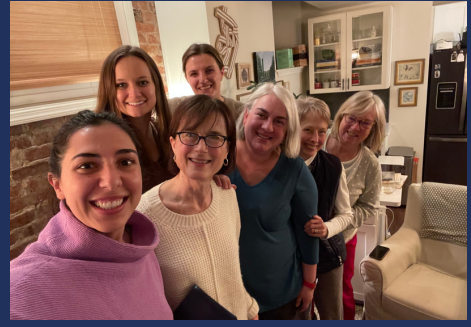
Women's Small Group