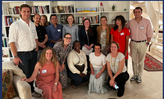
Young Adults Group

Our Christian Formation Committee provided rich opportunities for discipleship, study and fellowship among the the congregation throughout the year. In addition to incredible weekly Adult Education on Sunday Mornings and monthly Young Adult gatherings, new small groups for women of all ages launched in October, a large format Intergenerational Men's Ministry began meeting regularly, a Men's Bible Study gathered weekly, and we hosted two virtual Bible Studies in the Fall.